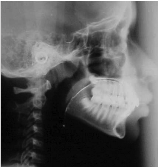
Fig 1. Lateral cephalometric radiography.