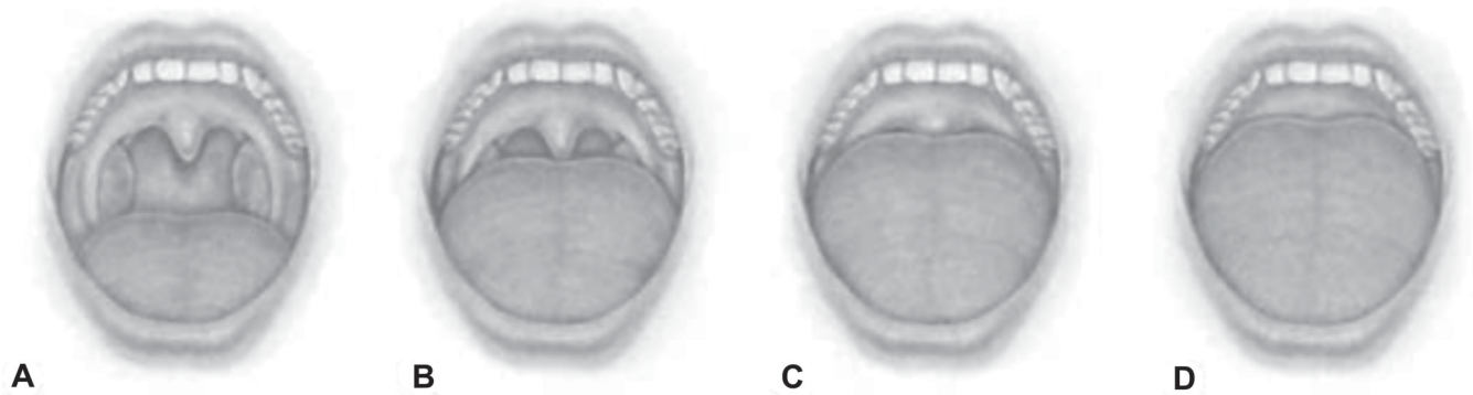
Fig. 2. Graphic representation of (A) Mallampati score classes

A. Class I – When tongue is in the oral cavity, tonsils, lateral columns and the whole uvula are easy to examine; B. Class II – The whole soft palate and the uvula are visible, excluding palatal tonsils; C. Class III – A part of the soft palate is visible but not the whole uvula; D. Class IV – The soft palate is visible only.